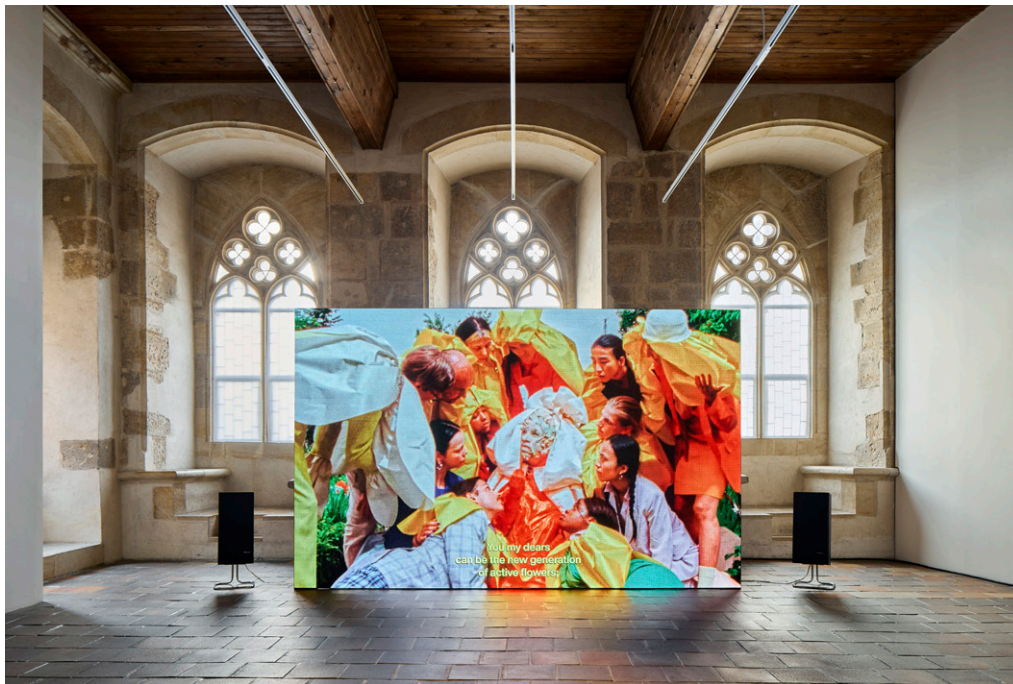
Opening Ceremony (10mins, 4K), Garden of Problems , GHMP House at the Stone Bell

In 2023 had an extensive solo exhibition at the Stone Bell House of the Prague City Gallery. He has also presented his work at Pioneer Works (2018) and Anthology Film Archives (2023) in New York, the 34th Ljubljana Biennale of Graphic Arts (2021), HEK in Basel (2020), and the 6th Athens Biennale (2018).