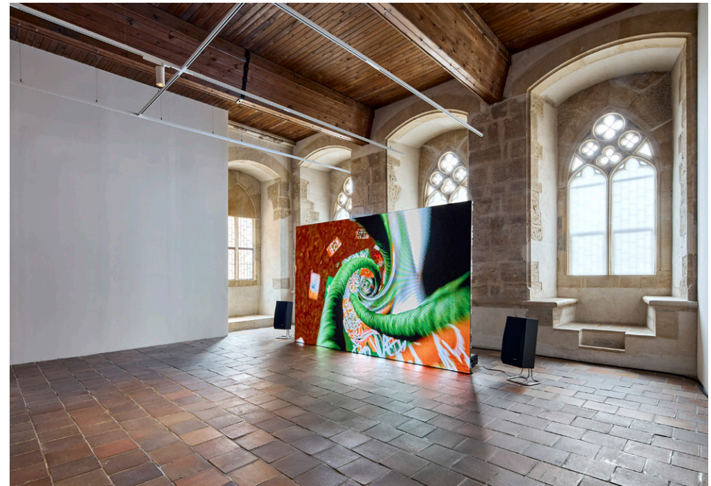
Opening Ceremony (10mins, 4K), Garden of Problems , GHMP House at the Stone Bell

In 2021 was awarded the Jindřich Chalupecký Award . His work Shame to Pride is part of the new permanent exhibition at the National Gallery Prague. In 2022 he created an new comprehensive work for the exhibition Flower Union , which was organized by the National Gallery Prague on the occasion of the Czech Presidency of the Council of the European Union. The latest, ninth episode of Club of Opportunities was commissioned for the 57th steirischer herbst (2024) at the Neue Galerie Graz.